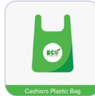
Cashiers Plastic Bag