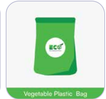
Vegetable Plastic Bag