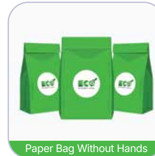
Paper Bag Without Hands