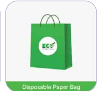
Disposable Paper Bag